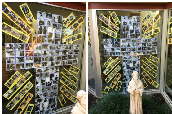
Risen Jesus Artwork by Year 6 students

"He is not here, for he has risen, as he said he would." (Mtt 28:1-10)