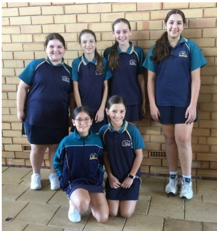
2024 Social Justice Leaders