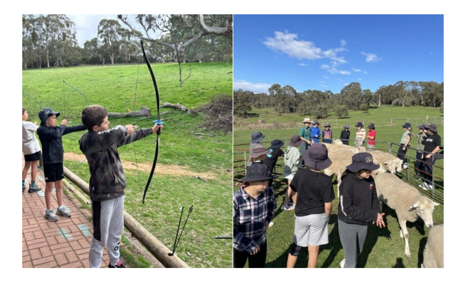
P Amazing effort by our Year 5's in 5MB at St Francis!